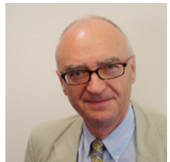
Sir Al Aynsley-Green, Children's Commissioner for England