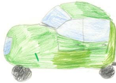
drawing by male student, Ballymacrickett Primary School

included speed, ease and fun. Many also stated that it prevents them from getting wet and they can remain 'nice and dry and warm' (female student, Enniskillen IPS) for the whole journey. These pupils also don't have to face students from the Further Education College and, therefore, have no worries about bullying or intimidation. Again, many children in Ballinamallard who used the car for their journeys to and from school enjoyed the experience. Some stated this is because they can keep warm and dry, they don't have to get up as early and many stated that because they live in the country they have no other choice – 'I have to get the car, there's no other way' (female student, Ballinamallard PS). The only negative issues raised about travelling by car included the number of cars outside the school, particularly in the afternoons. This, it was suggested, can make it very difficult to get past and sometimes the children are delayed as a result. This is also a problem in the mornings, 'but it isn't as bad then' (female student, Ballinamallard PS).