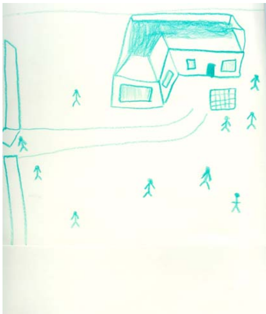
Children walking to school (picture by female student, Forge IPS)

walk to school in all conditions as they have no other option – ‘I walk in the rain and the snow as we don’t have a car’ (female student, St Brigid’s College). Concerns were, however, still prevalent regarding walking through certain areas, though walking anywhere in the dark was an area of increased concern among all participants, especially with St Brigid’s students and those from St Joseph’s who walked significant distances to the Markets area or beyond – ‘we just walk fast, ‘cos you don’t know who’s around’ (female student, St Joseph’s College). Of those who walked to and from Cambridge House Grammar School, journeys tended to be less than 10 minutes with little in the way of concerns apart from walking in dark or poor weather conditions. The absence of all but one crossing patrol in the vicinity of Dalriada School was an issue of concern, with many students expressing disquiet about the speeds and levels of traffic on their routes to and from school.