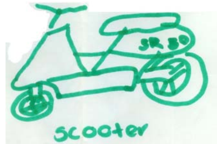
drawing by male student, Fort Hill College

Fort Hill pupils expressed concerns about the level of traffic and the resulting safety concerns for cyclists and mopeds. Traffic congestion means that there is little space for separate cycle lanes close to the school and this, it was felt, is a major deterrent to potential cyclists – ‘not many people bring their bikes because they don’t feel safe’ (female student, Fort Hill College). Not only does this deter cycling but a lack of safe and secure cycle facilities on school premises is also a further deterrent – ‘there’s nowhere to keep bikes safe anyway’ (male student, Fort Hill College). Moped users suffer from the same concerns, and this has resulted in the only moped user no longer using this mode of transport.