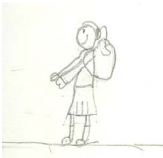
drawing by female student Ballinamallard Primary School

The majority of school buses at Lagan College drop off and pick up pupils in the school grounds at specially constructed bus stands. This, it was felt is a good arrangement with sufficient safety measures such as ‘guard rails and plenty of open space’ (female student, Lagan College). Other buses collect pupils and leave them on the road outside the school gates, a situation that was less enthusiastically received amongst pupils in the discussion group. Problems such as ‘narrow footpaths and large amounts of traffic’ (male student, Lagan College) here were also issues for concern. When pupils were using the scheduled Metro bus services from Four Winds terminus (about half a mile from the school), narrow footpaths, traffic levels and the speed of traffic in this area were mentioned as safety problems. Furthermore, there is limited space and poor shelter facilities at the terminus – ‘it can get very crowded and there’s hardly any room to stand’ (female student, Lagan College).