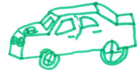
drawing by male student, Forge IPS

One pupil in Forge Integrated Primary School wrote that they would ideally like to “travel to school by plane or helicopter. I would like this because I could get to school quickly and land in the playground!” (male student, Forge IPS). The reasons for this view centred around the fact that those who use the bus can’t easily get into the