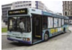
Translink Child Safety Bus

A number of other key stakeholder organisations, including transport providers and political representatives, responded to the stakeholders' questionnaire. Other information, such as press releases and policy statements, was received from stakeholders in relation to the issue of school travel. A brief summary of some of the points raised is outlined below.