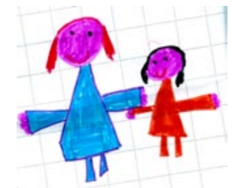
Drawing by female respondent, Chinese After School Club

This report outlines the views of children and young people who travel to school by a variety of modes of transport. It also identifies the views of parents who often decide how their children travel to school. Their collective views are important in terms of what needs to be done to improve their experience now and to make the necessary changes to encourage them to use public transport in the future.