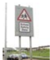
School safety zone at St Brigid's College, Derry/Londonderry