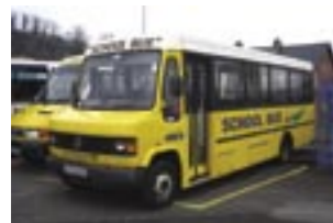
ELB school bus

In some cases: 'route planning leaves a lot to be desired – the bus goes round the world for a shortcut!' (female student, Lagan College).