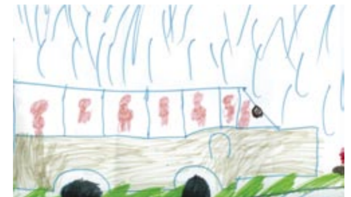
Drawing by male student, Mitchell House