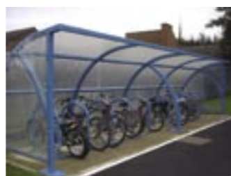
Sheltered cycling facilities at St Brigid's College, Derry/Londonderry