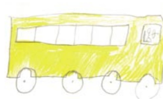
Drawing by male student, Mitchell House