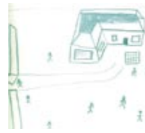
Children walking to school (picture by female student, Forge IPS)