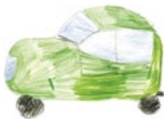
Drawing by male student, Ballymacrickett Primary School

Following an Inquiry by the Northern Ireland Assembly in 2001, attention has also been focused on the overcrowding on school buses and scheduled services run by Translink (NI Assembly, Committee for the Environment, 2001). This has also prompted a debate about safety on school buses and in particular the provision of seatbelts on buses and the '3 for 2' seat rule. More recently, following publication of the Burns and Costello Reports, Ministerial announcements about parental choice and new post-primary arrangements also raise issues about pupil movements between neighbouring schools (Burns Report, 2001; Costello Report, 2004; DE, 2005).