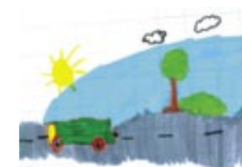
Drawing by male respondent, Chinese After School Club