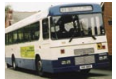
Ulsterbus vehicle on school bus duties