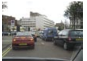
A familiar sight for those on the 'school run'